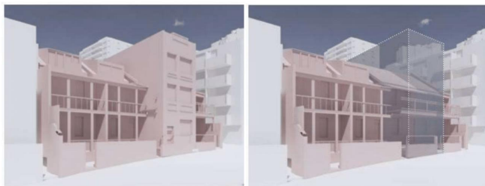
Figure 10: Proposed restoration of 96 Brougham Street