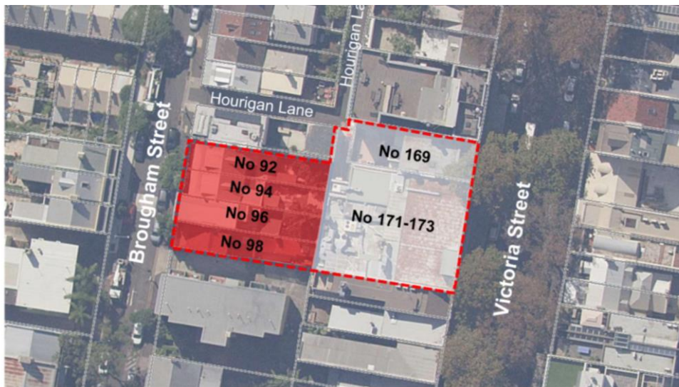
Figure 2: Site Identification Plan